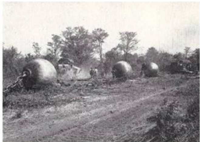
2. above Clearing the bush: steel balls being pulled by giant bulldozers.